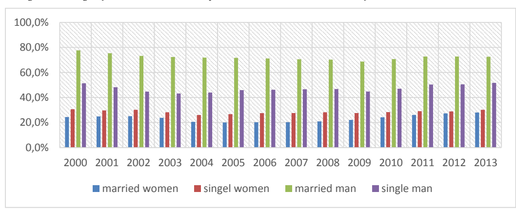
Graph 1. Employment in Terms of Marital Status in Turkey

Women are virtually absent from politics and public life, and urbanization and modernization will take some time to compensate for this imbalance due to the recent revival of traditional gender norms. The family remains the foundation of Turkish society, providing social and financial support, and employment, but rapid change and growing prosperity have affected the quality of society and social cohesion. Confidence has improved in urban areas and decreased in rural areas, suggesting that urbanization negatively affects traditional social relationships. Confidence in the government, however, decreased in Turkey between 2012 and 2017. Increasing economic prosperity seems to have weakened social cohesion, at least in the short run. One of the most important challenges facing Turkey is its low level of women participating in the labour market and politics. While legislation and action plans are being implemented, this is not enough.<sup>10</sup>